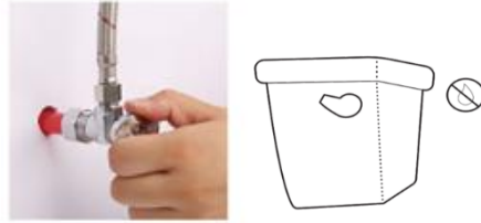
Shut off the water supply